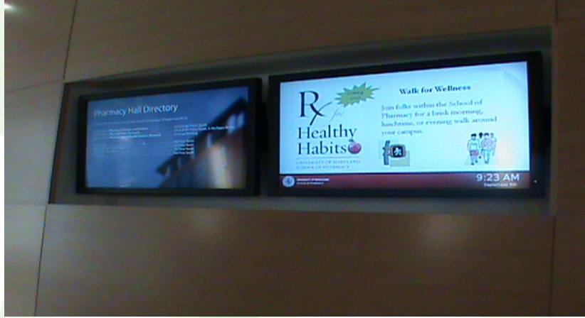
COMMON AREA DIGITAL SIGNAGE