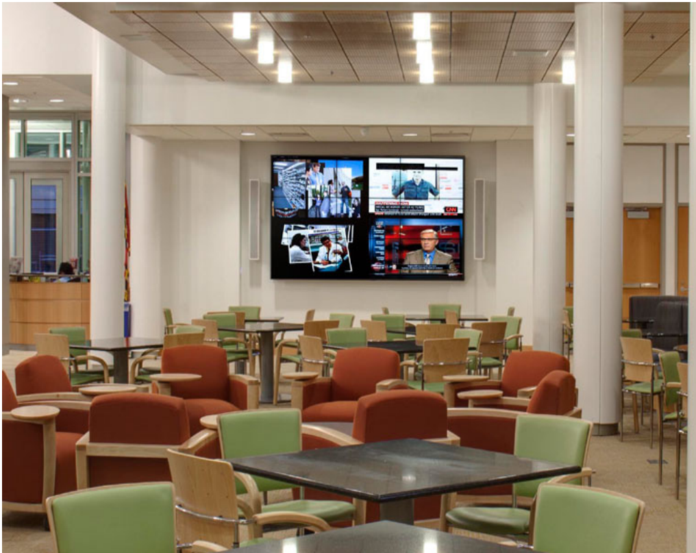
ATRIUM VIDEO WALL

“It was a wonderful collaboration, and I would not have been able to do it without Convergent Technologies.”